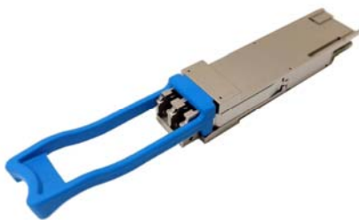
400G QSFP-DD Optical transceiver modules