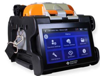
Core Alignment Fusion Splicer (TYPE-Q102-CA) Mass Fusion Splicer (TYPE-Q101-M12)